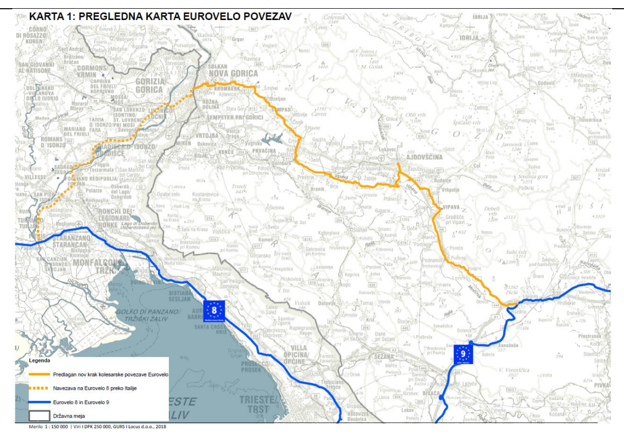
Figure: Map of EuroVelo path in the Goriška Subregion